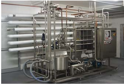
20 GPM Juice HTST