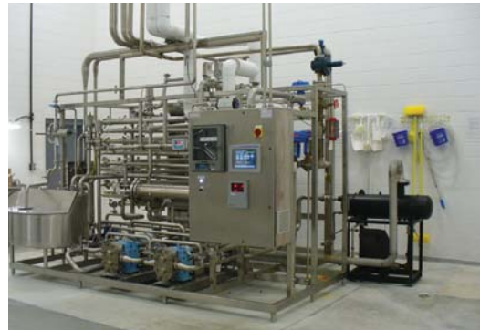
15 GPM Fruit Purée HTST