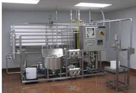
5 GPM Condiment Cooker