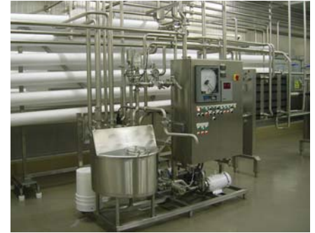
20 GPM Cheese Milk HTST