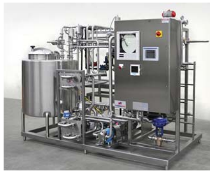
10 GPM Juice Concentrate HTST