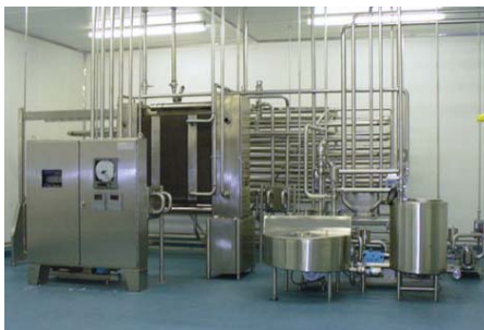
40 GPM Juice HTST