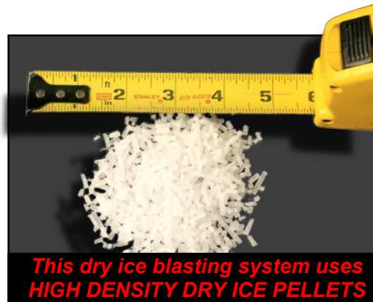
This dry ice blasting system uses HIGH DENSITY DRY ICE PELLETS

Most dry ice is made from recaptured or reclaimed carbon dioxide being emitted by industrial processes. Dry ice cleaning reduces and in some cases eliminates the need for hazardous cleaning chemicals. The dry ice particles disappear on impact resulting in significant reductions in the amount of hazardous waste being generated.